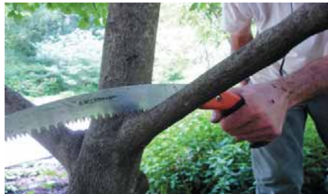
When pruning medium-sized branches, always make a small undercut first (left) and then finish the cut with an overcut (right). This prevents the bark from tearing downward when the branch falls.