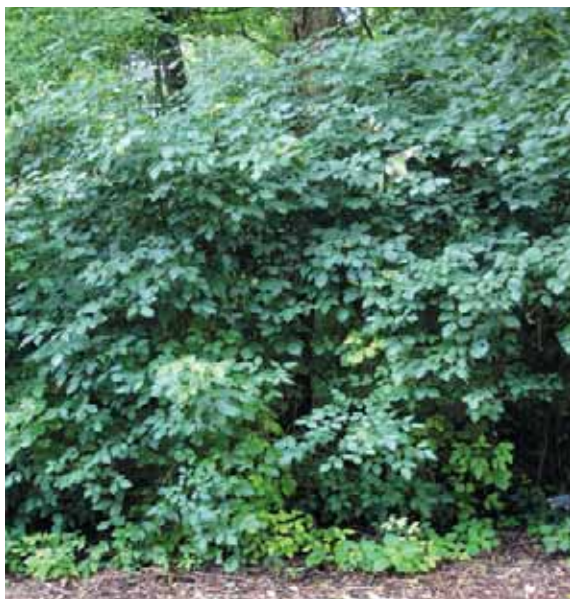
Bladdernut (Staphylea trifoliata) forms a dense screen with dark green leaves and lime-green seed pods in summer.

Aesculus pavia (red buckeye 10-15') Amsonia illustris (shining bluestar 3-4') Andrachne phyllanthoides (Missouri maid- enbush 3-4') Aronia melanocarpa (black chokeberry 5-6') Callicarpa americana (beautyberry 4-5') Dirca palustris (leatherwood 3-5') Hydrangea arborescens (wild hydrangea 3-4') Ilex verticillata cultivars (winterberry 4-6') Neviusia alabamensis (Alabama snowreath 6-8') Ostrya virginiana (hop hornbeam 15-20') Ribes missouriense (Missouri gooseberry 3-4', thorns) Staphylea trifoliata (bladderpod 6-8') Viburnum dentatum (arrowwood viburnum 5-7') Viburnum molle (Kentucky viburnum 6-8')