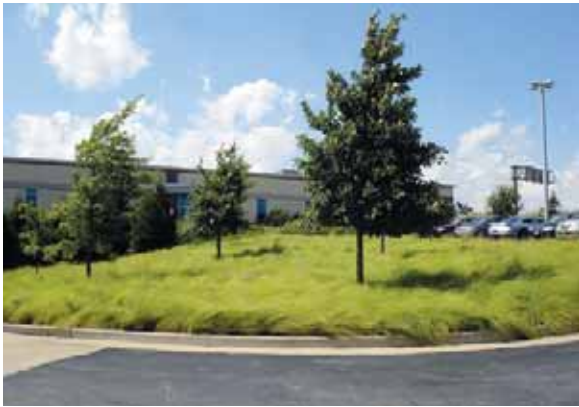
Prairie dropseed (Sporobolus heterolepis) growing as a groundcover at Missouri Botanical Garden.