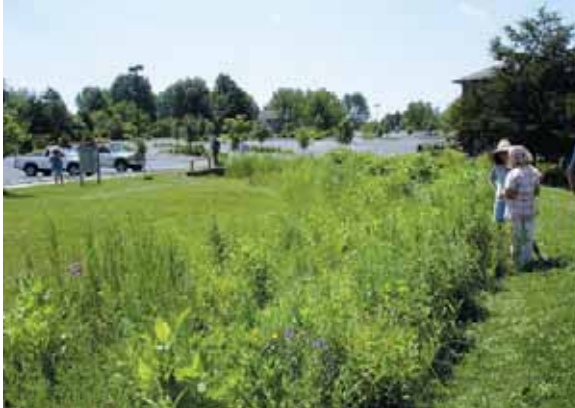
Bioretention seeding in Columbia, Missouri reduces maintenance costs associated with mowing, mulching, and weeding.