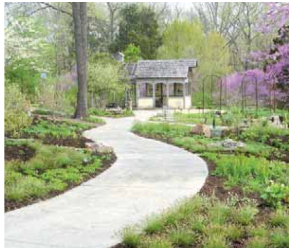
Native landscapes in the Whitmire Wildflower Garden, Shaw Nature Reserve.

use of native plants in residential garden design, farming, parks, roadsides, and prairie restoration. Miller called his work “The Prairie Spirit in Landscape Design”.