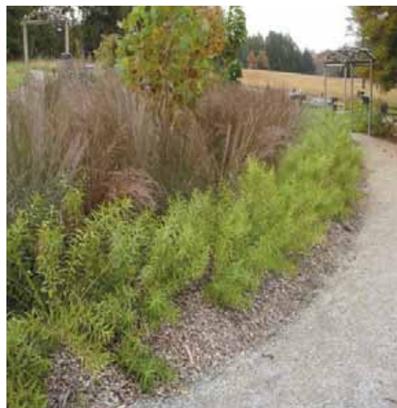
Shining bluestar (Amsonia illustris) hedge along walkway.

Andrachne phyllanthoides (Missouri maid- enbush) Ilex decidua (possum haw) Juniperus virginiana (eastern red cedar) Physocarpus opulifolius (ninebark) Ptelea trifoliata (wafer ash)