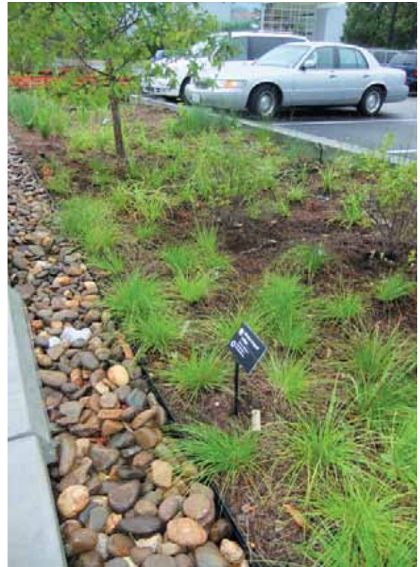
The proper handling of stormwater runoff is a significant issue for homeowners, neighborhoods and communities. Left: a rain garden planted with Missouri native plants at the Missouri Methodist Conference Center in Columbia, Missouri. Right: Missouri Botanical Garden bioretention best management practice (BMP) planted with natives in the main entry parking lot (oak sedge ( Carex albicans ) in foreground).