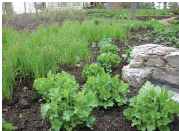
Low-maintenance native groundcovers are used in simple massed plantings. When fully mature they suppress weeds and reduce the amount of mulch needed. Left: yellow fox sedge ( Carex annectans ) Right: prairie alumroot ( Heuchera richardsonii )