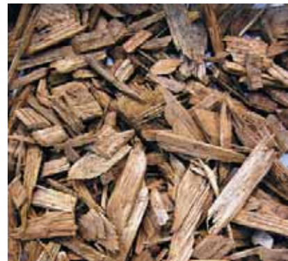
Left: Shredded hardwood bark mulch binds together to resist washing away. Middle: River gravel mulch will not migrate where water flow is a problem. Right: Wood chip mulch is inexpensive or often free but migrates and may float away where water flow occurs.