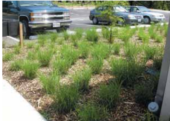
Palm sedge (Carex muskingumensis) tolerates clay soils and can grow in sun or shade.

Baptisia bracteata var. leucophaea (cream wild indigo) Coreopsis lanceolata* (lance-leaved coreopsis) Coreopsis palmata (finger coreopsis) Dalea candida (white prairie clover) Dalea purpurea (purple prairie clover) Echinacea purpurea* (purple coneflower) Eryngium yuccifolium (rattlesnake master) Heliopsis helianthoides (false sunflower) Liatris pycnostachya (prairie blazing star) Liatris spicata (marsh blazing star) Monarda fistulosa (wild bergamot) Parthenium hispidum (American feverfew) Parthenium integrifolium (wild quinine) Penstemon digitalis (smooth beard-tongue) Polygonatum biflorum var. commutatum (Solomon's seal) Ratibida columnifera (Mexican hat) Ratibida pinnata* (grayhead coneflower) Rudbeckia fulgida (orange coneflower) Rudbeckia hirta (black-eyed Susan) Silphium integrifolium (rosinweed) Silphium laciniatum (compass plant) Silphium perfoliatum* (cup plant) Solidago rigida* (stiff goldenrod) Solidago speciosa (showy goldenrod) Tradescantia ohiensis* (Ohio spiderwort) Vernonia arkansana (Arkansas ironweed) Zizia aurea* (golden Alexander)