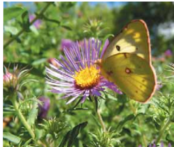
Left: Luna moth perched on wood poppy. Right: Sulphur butterfly getting nectar from a New England aster blossom.