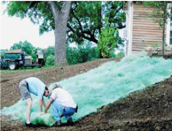
Unroll erosion control blankets from top of slope to bottom and overlap edges to attain complete coverage. Pin down blankets securely.

jute and are woven into a plastic mesh that should be biodegradable. Avoid non-biodegradable or permanent fabrics because birds and reptiles get tangled in the mesh.