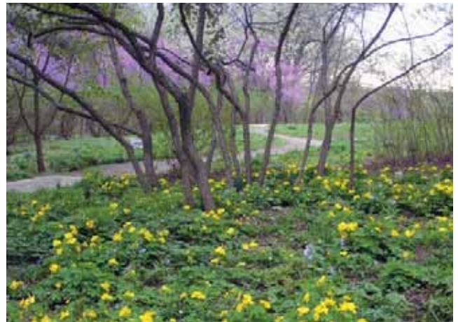
Wood poppy (Stylophorum diphyllum) and Virginia bluebell (Mertensia virginica) spread from seed in the Whitmire Wildflower Garden.

Aquilegia canadensis (wild columbine) Aster drummondii (Drummond aster) Campanula americana (Amer. bellflower) Echinacea purpurea (purple coneflower) Geranium maculatum (wild geranium) Mertensia virginica (Virginia bluebells) Phlox divaricata (wild sweet William) Phlox paniculata (meadow phlox) Polemonium reptans (Jacob's ladder) Scutellaria incana (downy skullcap) Solidago caesia (blue-stem goldenrod) Solidago flexicaulis (zig-zag goldenrod) Stylophorum diphyllum (wood poppy) Tradescantia ernestiana (Palmer's spiderwort) Viola pubescens (yellow violet) Viola sororia (common violet) Viola striata (cream violet)